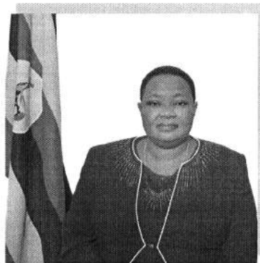
Rt. Hon. Nabbanja Robinah Prime Minister and Leader of Government Business

The Office of the Leader of Government Business in Parliament is mandated to lead and coordinate all Government Business in Parliament through Section 6H of the Administration of Parliament (Amendment) Act, 2006 and Rules 15, 28, 41, 114 of the Rules of Procedure of the Parliament of Uganda. In addition, the office is also responsible for the welfare of Members of Parliament that belong to the ruling party in executing their duties both in the Committees of Parliament and during plenary sittings of Parliament.